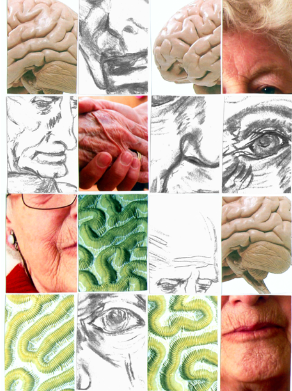
nosca development and validation of the nurses' observation scale for cognitive abilities Anke Persoon